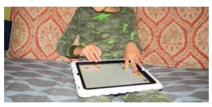
5 Ways to Get a Free iPad for Your Special Needs Child!

A collection of 15 (mostly free!) apps perfect for kids who are blind or visually impaired. Listed in categories ranging from visual stimulation to communication and fine motor needs.