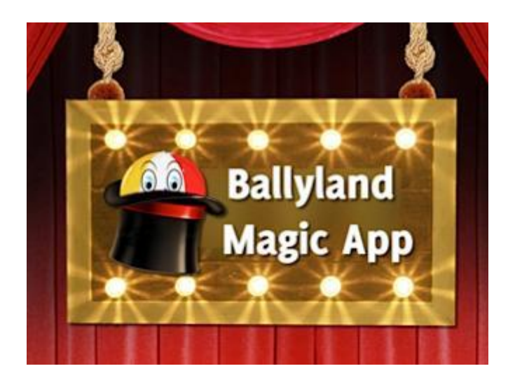
Ballyland Magic App: Introducing iPad Accessibility to Children Who are Blind or Visually Impaired

Ballyland Magic app introduces visually impaired and blind kids to iPad accessibility features like VoiceOver through a fun game. Enter to win a free download!