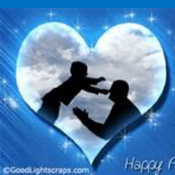
For all the laughter and smiles, For the happiness & good times, For listening & caring, and loving & sharing. For your strong shoulders And kind heart. Love You_!