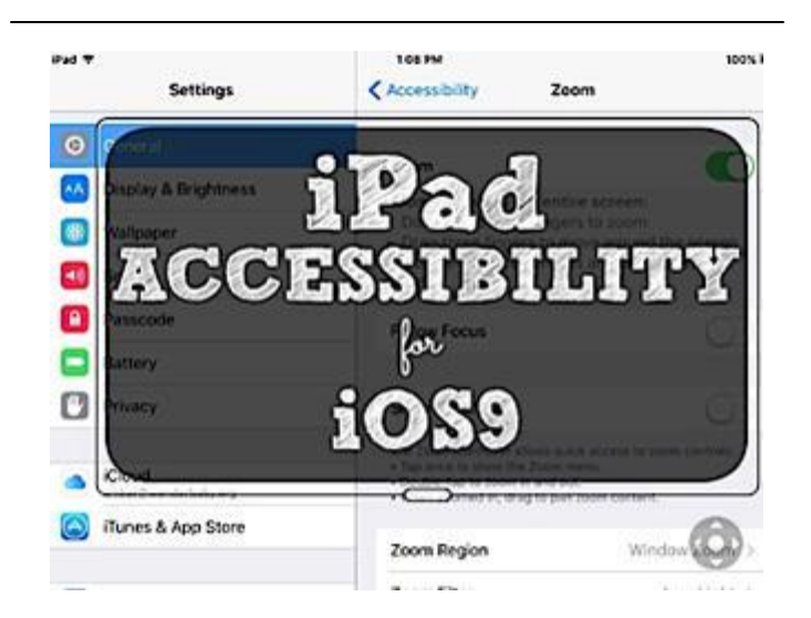
Top 10 iPad & iOS9 Accessibility Features

Ballyland Magic app introduces visually impaired and blind kids to iPad accessibility features like VoiceOver through a fun game. Enter to win a free download!