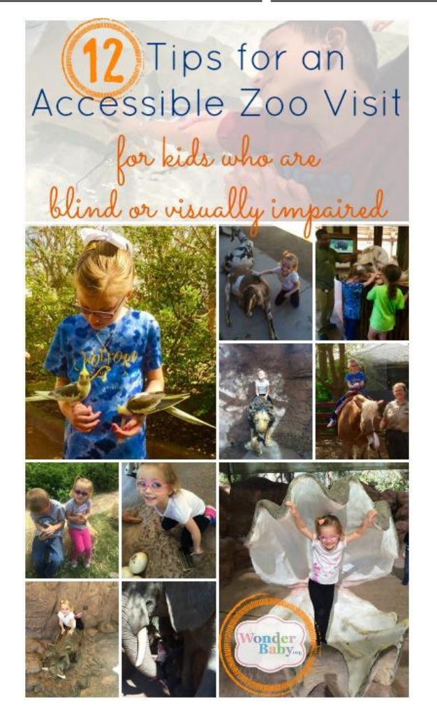
12 Tips for an Accessible Zoo Visit

Braille Bricks is a new toy set aimed at promoting braille literacy... http://www.wonderbaby.org/resources/ braille-bricks