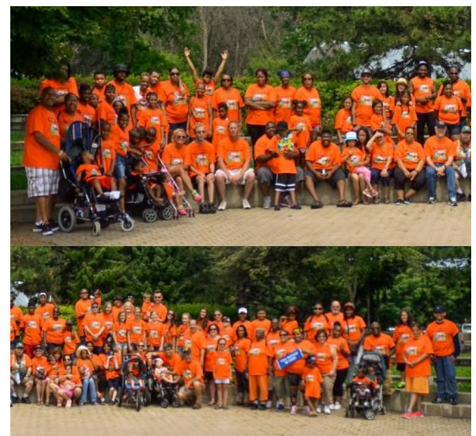
2015 Zoo Trip